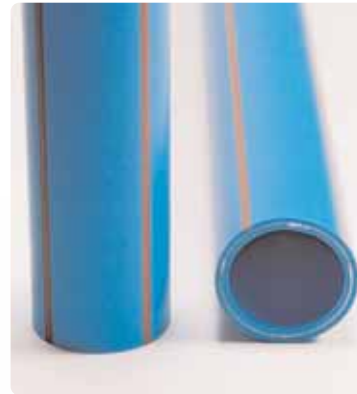
Puriton pipe has a longitudinally lap welded aluminium core positioned between two layers of polyethylene

The heart of the system is a multi-layer polyethylene pipe which has a longitudinally lap welded aluminium core, positioned at the centre of the pipe wall providing a full metallic barrier to the ingress of contaminants and protected by the inner and outer layers of polyethylene.